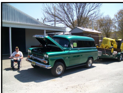
Glenn Hermel 1959 Chevy Panel Truck w/409 truck engine & 1953 Huber Road Maintainer